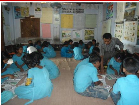
CPS students are studying in the class room