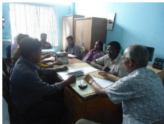
School Management Committee reviewed the plan vs achievement in a meeting

The project has assisted to operate the activities smoothly and arranged regular monitoring based on plan of the project. It has identified the deviation on standard and achievement for providing information to adopt corrective measures. Program Manager and Supervisors & In charge of respective section visited and monitor the activities using checklist according to the target. Senior management personnel made some visit and they have given their feedback to track the as of plan. Rishilpi Monitoring cell monitor the project activities according to the logical frame target and they submitted the report to the respective department. The Program also shared the findings on report with the employees and compliance the findings within the shortage period.