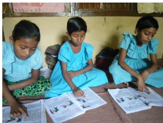
Class Conduct community primary school