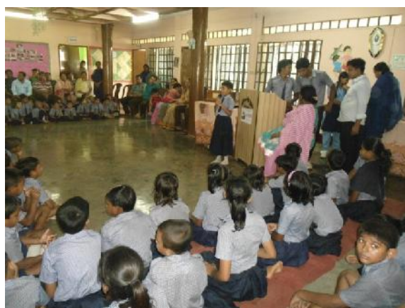
RCS Celebrated the birthday of world famous poet and noble laureate Rabindro Nath Thagore

School authority organized co-curriculum activities regular basis according to the plan. It has created opportunity for the students to explore their potentiality and have opportunity to develop their life skills. Students have the opportunity to learn from the events from enjoyment. They focused their potentiality and skill by dancing, signing, reciting poem, debating and delivering speech as per topics. It also enhances their adaptability capacity and develops their life skill. The school has organized celebration of birth day of our two bengoli poet Rabindranath Tagore and Kazi Nazrul Islam National Day, total about 345 students participated from RCS & SSHIC on the events.