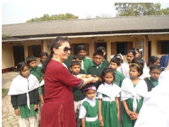
and Hearing Impaired Competition Prize

Project monitoring and internal evaluation focused that project progress is in satisfactory level, except some problems at community level everything is running smoothly. Regular Project Management meeting organized and monthly project progress was analyzed in the meeting by the project team, Project team shared their opinion to improve the service quality and constraint faced during the implementation, how they overcome the challenges. Beside these, section wise weekly meeting conducted to share their opinion for ensuring the quality of education. In community level the CPS school teachers and staff meeting conducted regular basis according to the plan.