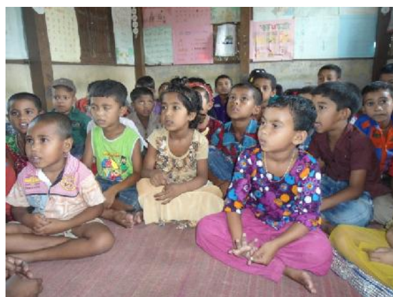
Class room on Early Child Development